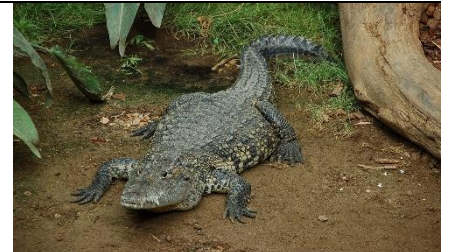
This Photo by Unknown Author is