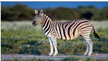
This Photo by Unknown Author is